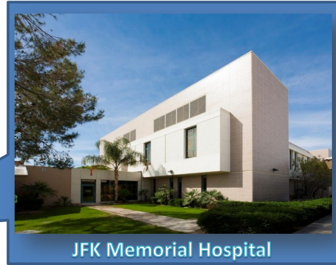
JFK Memorial Hospital