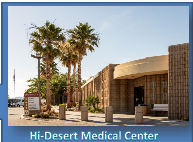
Hi-Desert Medical Center