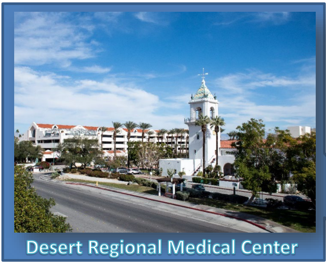
Desert Regional Medical Center